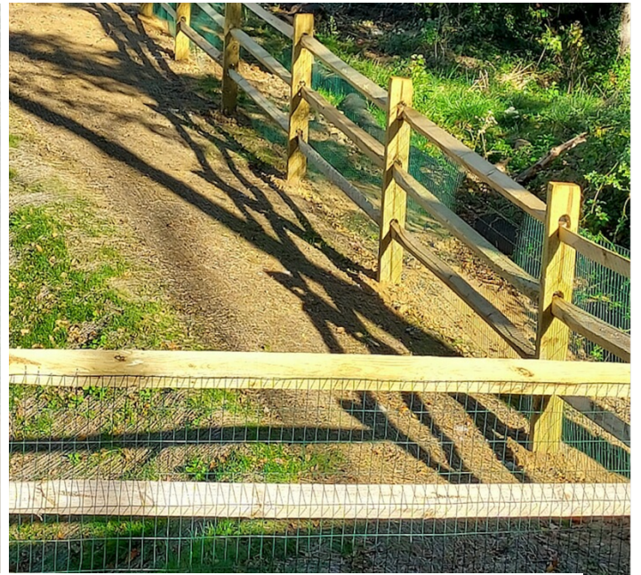
A close-up of the fencing and wire mesh.

Final before and after photos of this inaugural Langhorne Manor stormwater project!