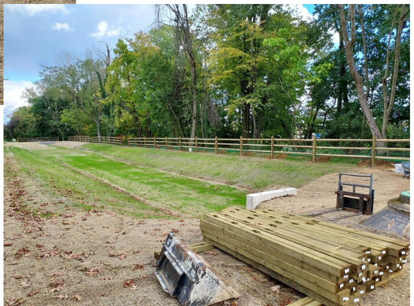
Split-rail fencing is partly complete.