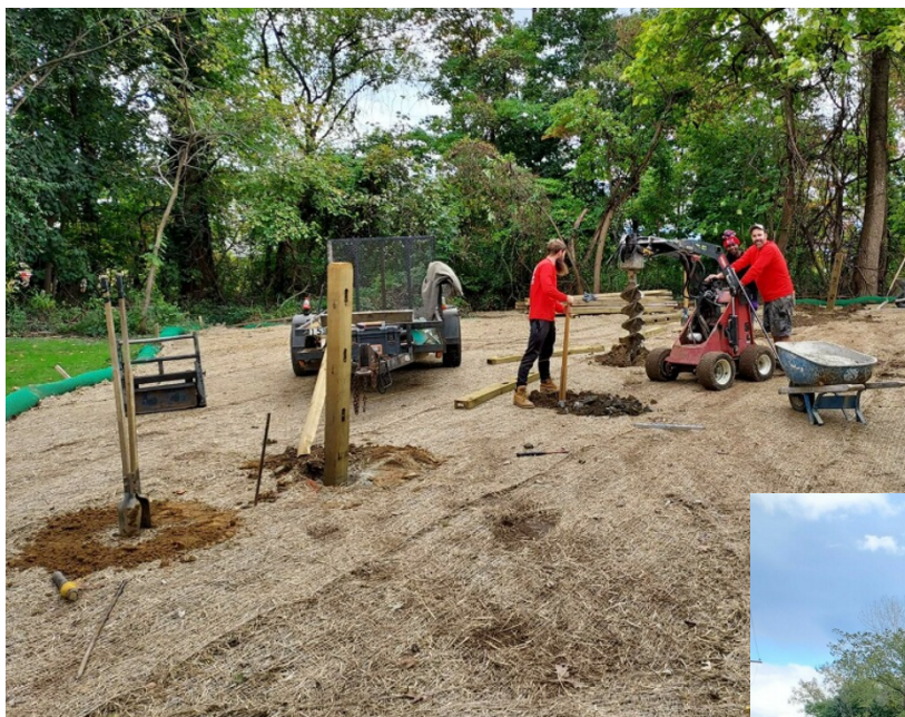
The first fence posts are installed.

The borough, in conjunction with RVE, will develop a maintenance plan for the area which will include performance inspections, lawn care, removal of any items that become caught in the trash racks, and periodic sediment removal. The new grasses and wildflowers in the basin may seem a bit unkempt over the first year, but any appearance of “overgrowth” is intentional as we allow for the plantings to become established.