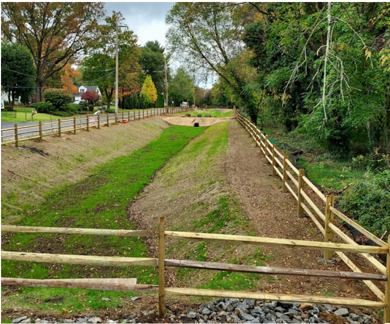
Fencing is finished.