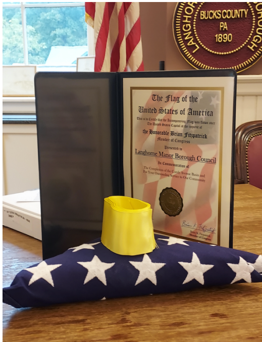
Congressman Fitzpatrick presented LMB with a commendation and a flag previously flown over the U.S Capitol.