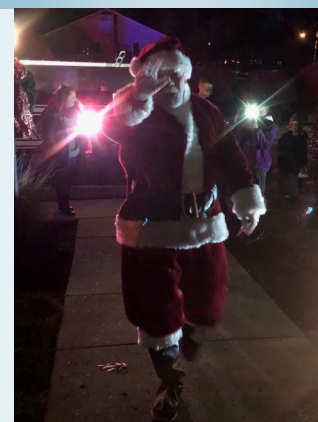
Santa Claus Came To Town!