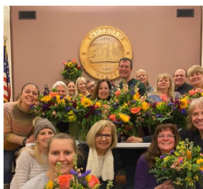
Look at all those smiling faces and gorgeous arrangements!