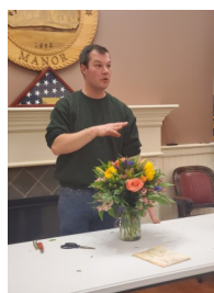
The perfect instructor!