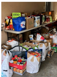
Residents are so generous!

In early December, we gathered for the 4th Annual Tree Lighting and Cookie Sharing event that was the beginning of a great Holiday season. Many bought luminaries that were displayed on Christmas Eve to Light Up the Manor.